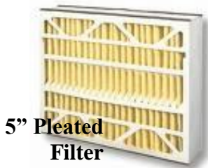
5" Pleated Filter